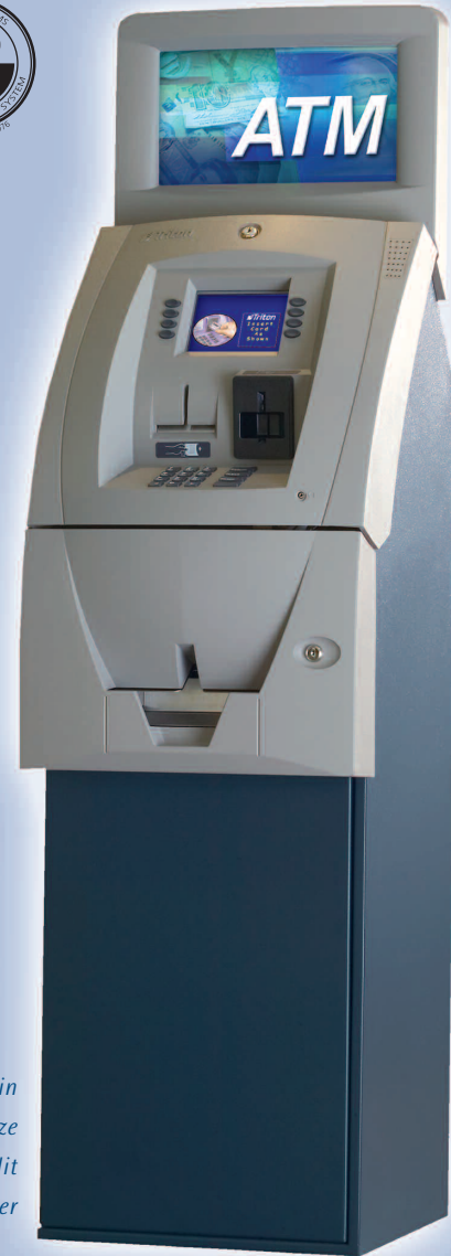
9100 in bayou bronze with backlit topper

Triton Headquarters • 522 East Railroad Street Long Beach, Mississippi 39560 USA With offices throughout the U.S. and worldwide including Canada, UK, Australia, and Hong Kong Phone: 1-228-868-1317 • Toll free: USA & Canada 1-800-367-7191 www.triton.com • Email: sales@trtn.com