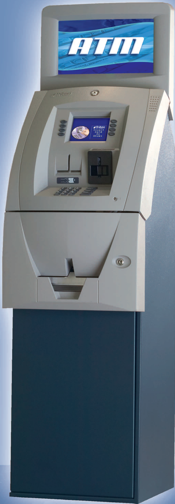
9100 in bayou bronze with backlit topper

The 9100 is our best selling ATM. This extremely popular machine was designed to be a low cost high-performance ATM. And it has proven to be perfectly suited for owners who need functionality and performance at a lower price point.